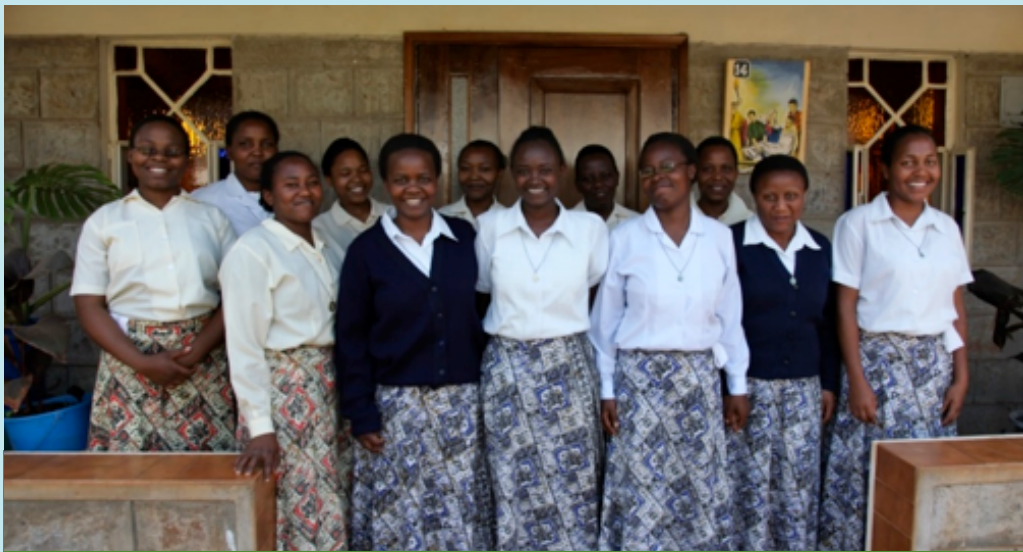
Postulants and candidates of the Assumption Sisters of Nairobi, pose for a picture. SLDI Alumnae play a role in the Formation of the young members aspiring to religious life.