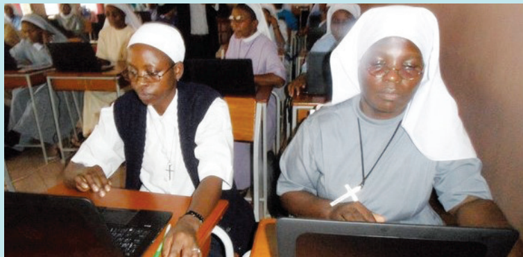
Sisters participate in SLDI Finance training, Tanzania.