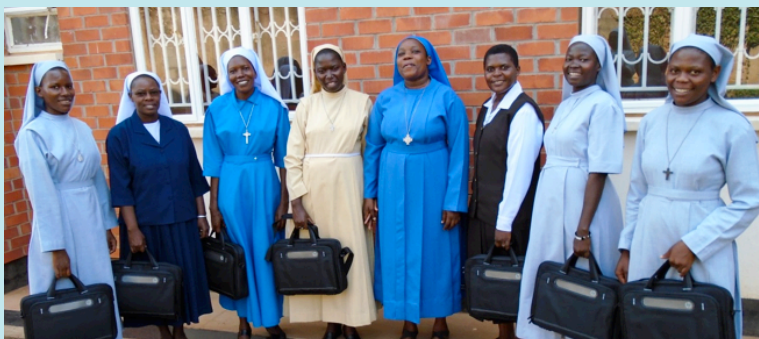
Through a partnership between ASEC and Kisubi Brothers University, Uganda, eight sisters, pictured with their laptops, are studying for BA in Business Administration.