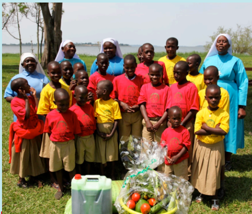
SLDI alumnae have created innovative projects to ensure food security. Sisters are pictured with children and nutritious food items at Kyasira Home, Uganda.