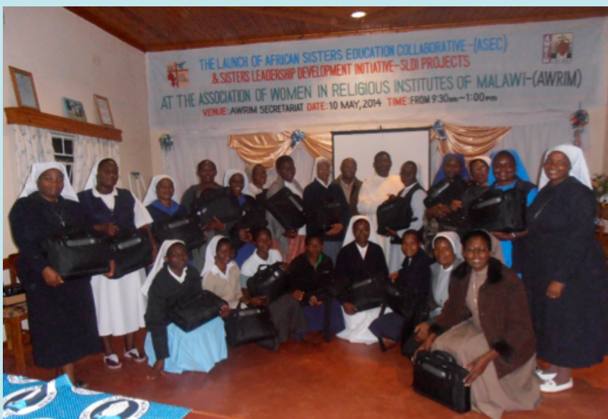
Sisters pose with their laptops during the first SLDI course in Malawi.