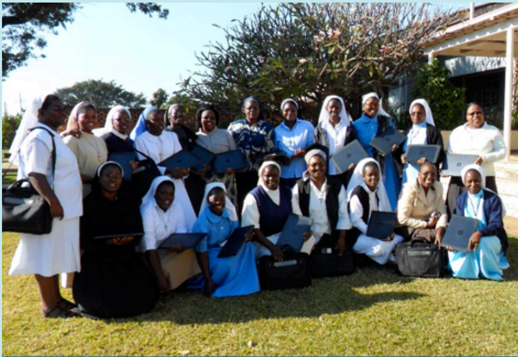
SLDI Financial Training Track 1 posing with their new Laptops. The training occurred in Zambia, June 1 - 28, 2014.