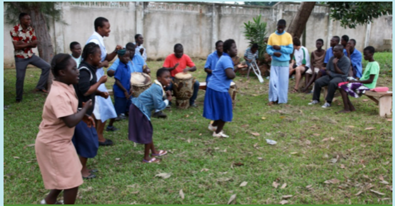
Sisters bring hope and provide education to children.