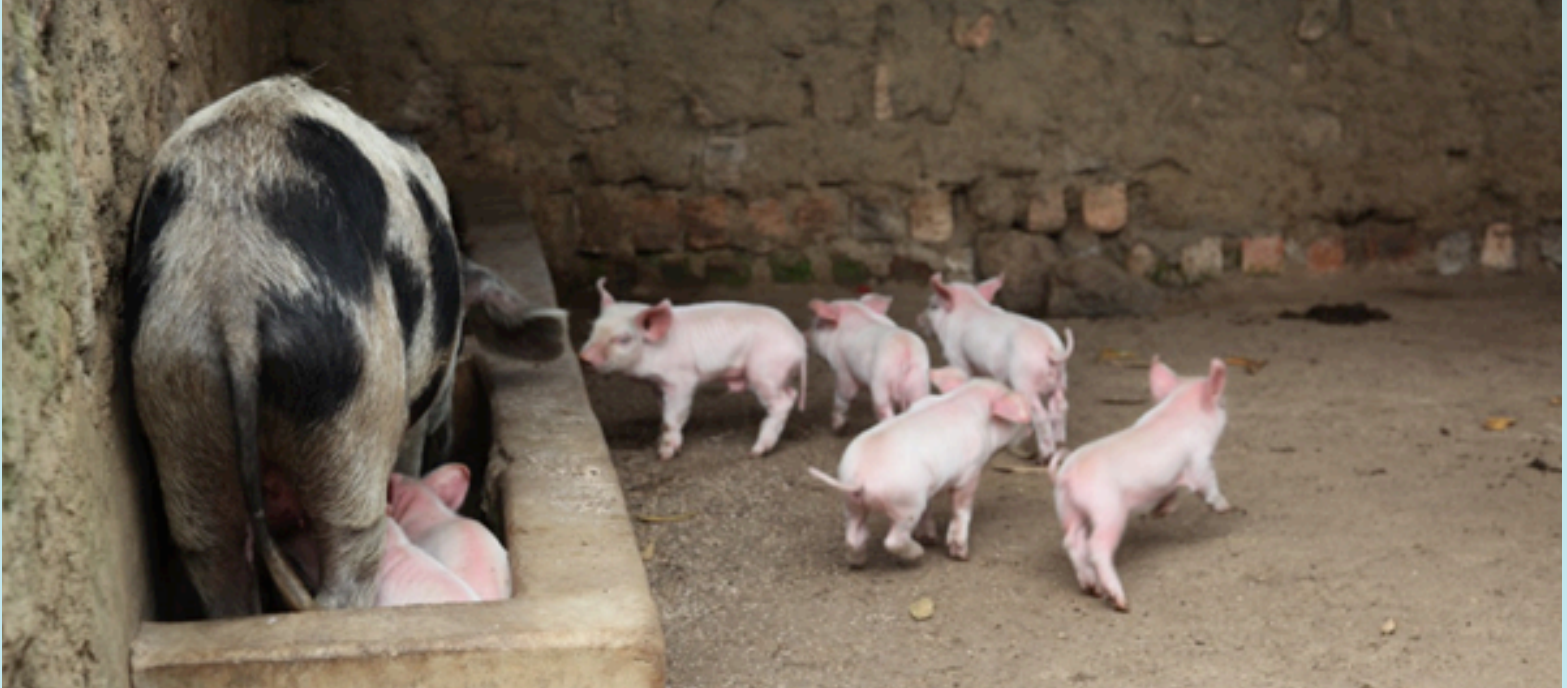
Piggery farming is a common project for Sisters in Africa – Nigeria, Uganda, Kenya, and Tanzania.