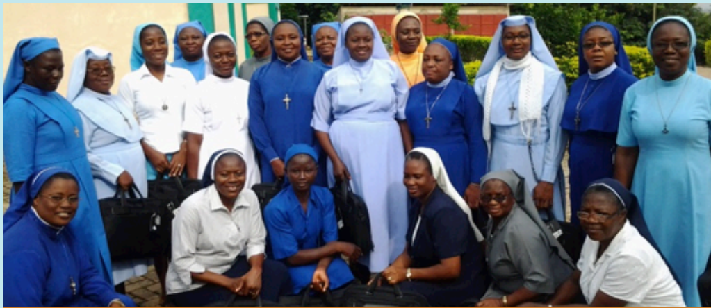
Twenty sisters from 12 Congregations participated in the SLDI Administration Workshop II at the Institute of Continuing Formation (ICF), Ghana.