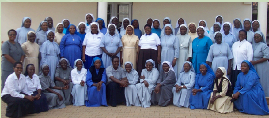
Participants in the SLDI, Uganda, Alumnae Workshop are pictured in January 2014.

After the facilitators provided lectures on the chosen topics, the members had time for group discussion and sharing experiences. In the sisters' daily lives, these skills can be used to mitigate and resolve conflicts, build peaceful communities, and be efficient in their ministries.