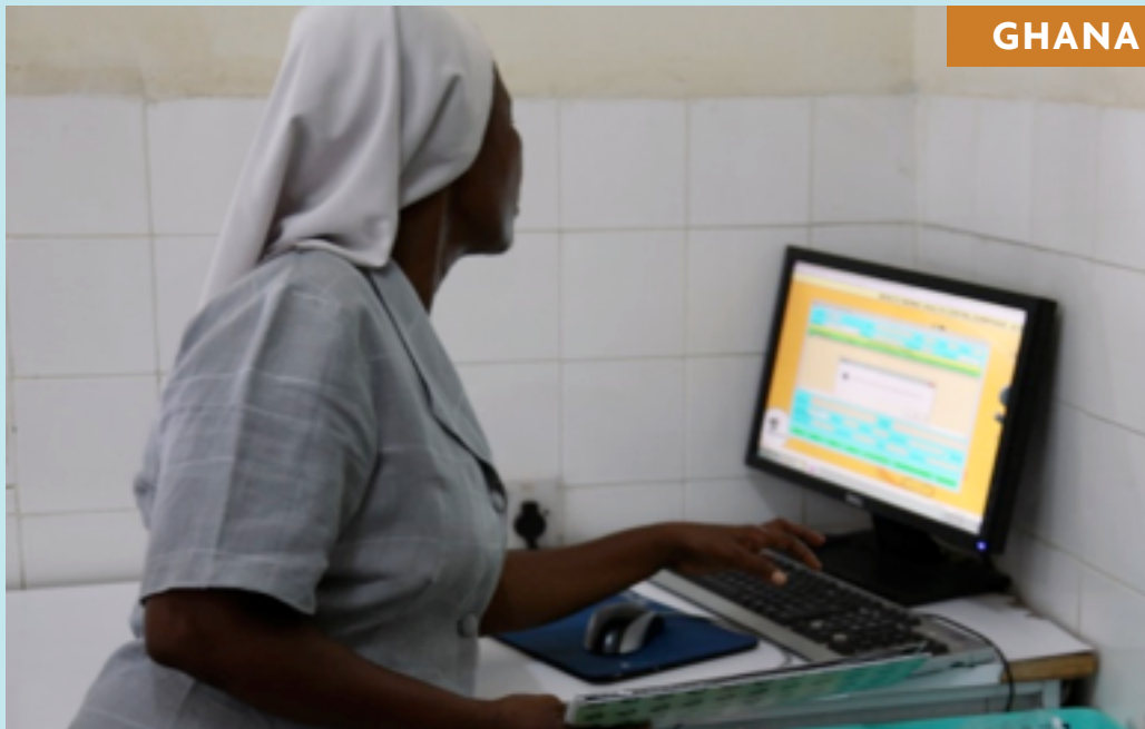
An SLDI alumna in Ghana showcases one of her projects to modernize a health clinic at Dompase. She installed a networked platform to track patients' data for more effective delivery or services.