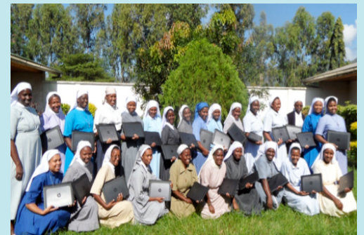
A portion of 100 Catholic Sisters in Tanzania benefiting from the SLDI program, funded by the Conrad N. Hilton Foundation, pose with their new laptops.