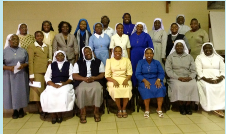
In January 2014, a HESA Framework of Reference was signed between ASEC and AOSK at Chemi Chemi, in Nairobi, Kenya, this partnership will benefit sisters to study for Theology and Catechetical the focus to provide Theological studies. Sisters from all ASEC countries are welcome to participate in the program.