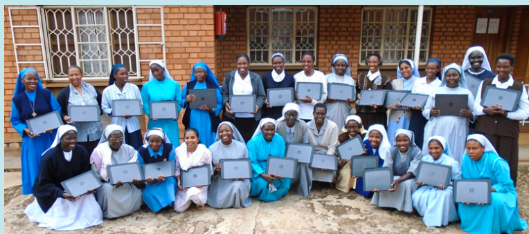
A portion of 100 sisters from Uganda and South Sudan who participated in an SLDI workshop in Uganda, pose with their laptops.