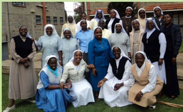
Students enrolled at Marywood-CUEA through the HESA program, pose for a picture during reflective learning, May 2014.

The second MU-CUEA cohort began classes in January 2014, online at Marywood, and completed 27 credits in 2014. The sisters participated in reflective learning, May 2014. They continue to thrive in the program.