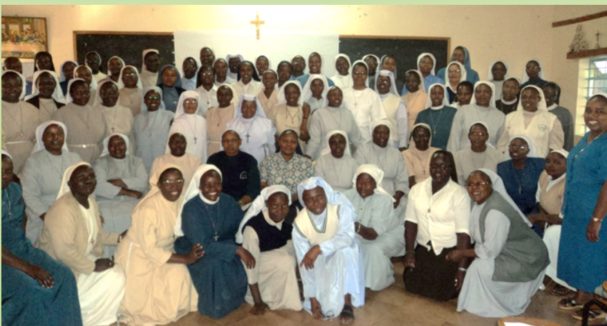
SLDI Alumnae pose during the SLDI Alumnae Meeting in Kenya, February, 2014.