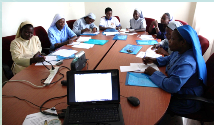
Eight new HESA students participate in orientation for Kisubi Brothers University College Uganda at Association of Religious of Uganda Center, Kampala, Uganda.

Each cohort of entering students participated in an orientation in the summer. During these sessions students bonded and were introduced to HESA and their university. Students studying online participated in three-week orientations, which cover topics including, computer skills, goal setting, and time management.