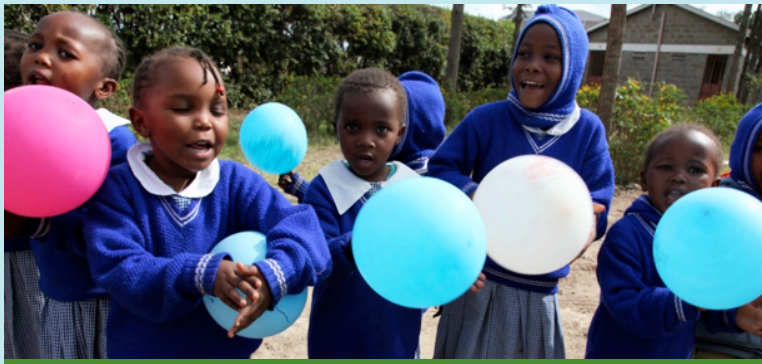
Children who are benefiting from the programs run by the Evangelizing Sisters of Mary pose for a photo. Bringing a smile is one of the goals for sisters in their ministries.