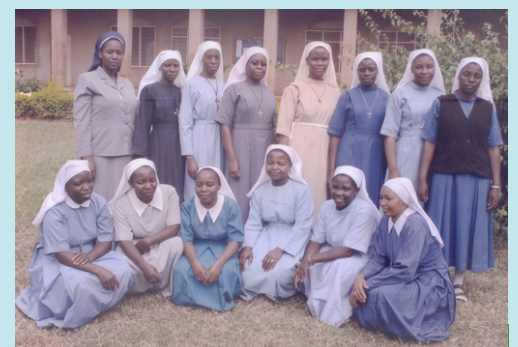
The ASEC Scholarship Program continues to benefit Sisters in Tanzania to acquire a high school diploma. 43 Sisters and three lay girls have benefited from the program. Pictured are 14 Sisters from various congregations, awarded scholarship in 2014.