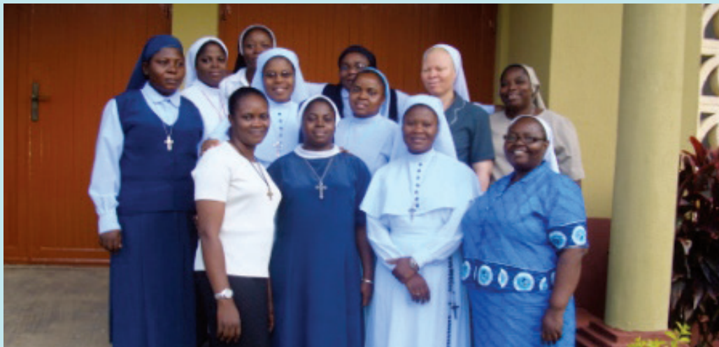
Students enrolled at Chestnut Hill College participate in a mid-semester meeting.