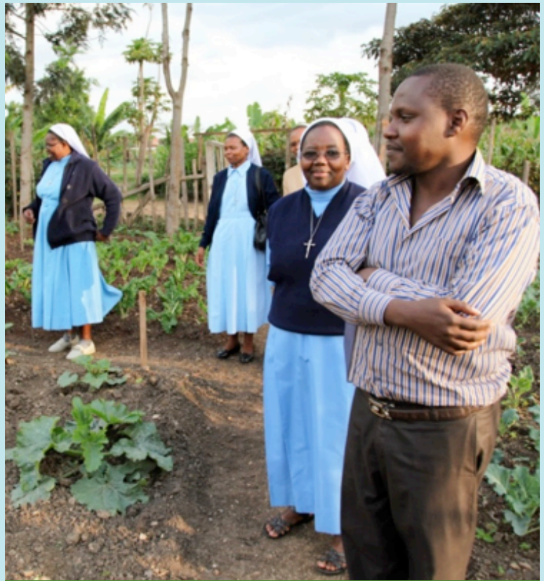
SLDI alumnae at the Evangelizing Sisters of Mary, set up a greenhouse and are using drip irrigation to grow food for their communities, schools, etc.